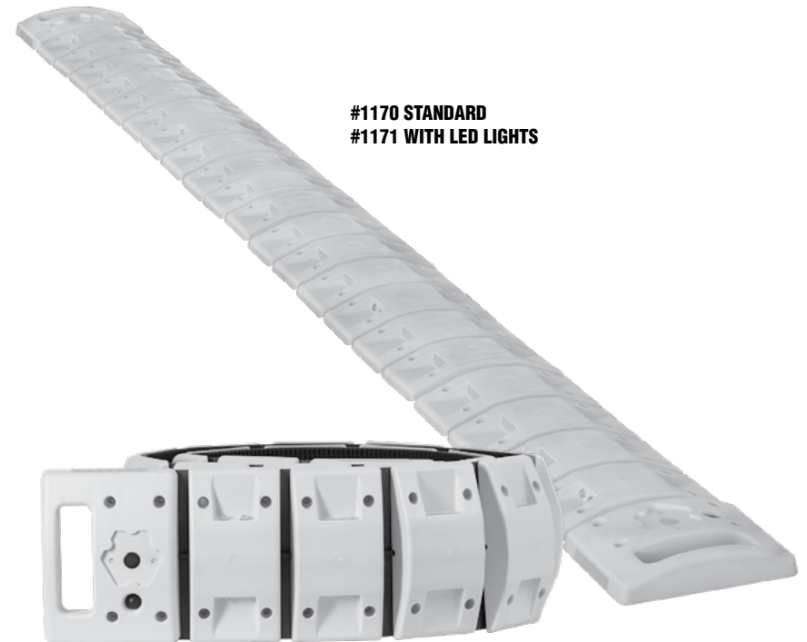
#1170 STANDARD #1171 WITH LED LIGHTS